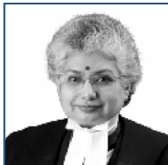
Hon'ble Mrs. Justice B. V. Nagarathna Judge Supreme Court of India