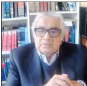
Mr. Harish Salve Senior Counsel Member Queen's Counsel