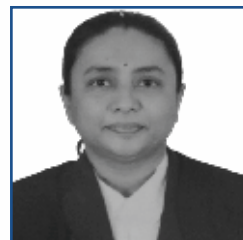
Hon'ble Ms. Justice Nisha Thakore Judge High Court of Gujarat