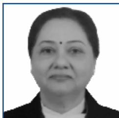
Hon'ble Ms. Justice Mauna Bhatt Judge High Court of Gujarat