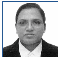
Hon'ble Ms. Justice Gita Gopi Judge High Court of Gujarat