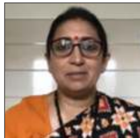
Smt. Smriti Irani Union Cabinet Minister of Women and Child Development