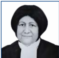
Hon'ble Ms. Justice Indira Banerjee Judge Supreme Court of India