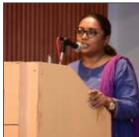
Hon'ble Ms. Justice Nisha Thakore Judge High Court of Gujarat