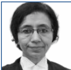
Hon'ble Ms. Justice Sonia Gokani Judge High Court of Gujarat