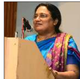
Hon'ble Ms. Justice Gita Gopi Judge High Court of Gujarat