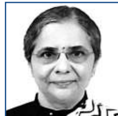
Hon'ble Ms. Justice Bela Trivedi Judge Supreme Court of India