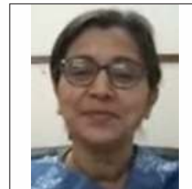
Hon'ble Ms. Justice Sangeeta Vishen Judge High Court of Gujarat