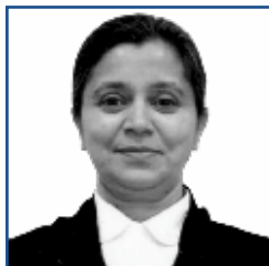
Hon'ble Ms. Justice Sangeeta Vishen Judge High Court of Gujarat