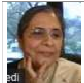
Hon'ble Ms. Justice Belaben Trivedi Judge Supreme Court of India