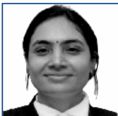
Hon'ble Ms. Justice Vaibhavi Nanavati Judge High Court of Gujarat