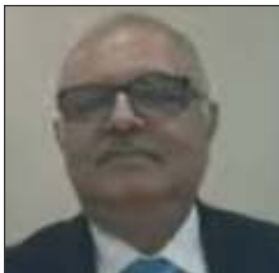
Hon'ble Mr. Justice Bhargav Karia Judge High Court of Gujarat